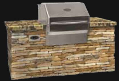
MEMPHIS PRO™ BUILT-IN