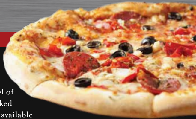
Wood-Fired Pizza Oven Capabilities

Our superior craftsmanship and strict adherence to manufacturing standards guarantee products with unbeatable reliability and durability in any climate or weather condition. All Memphis Wood Fire Grills are designed, engineered and manufactured in an ISO 9001:2008 facility in the USA. All models have a 5-year limited warranty.